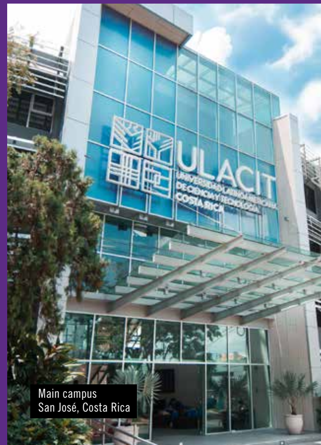
Main campus San José, Costa Rica